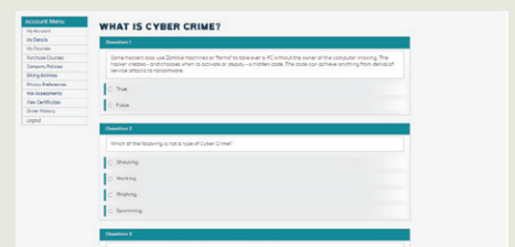
Final exam - certificates provided.

Unfortunately, cyber crimes are becoming increasingly prevalent. The consequences can be catastrophic, especially in terms of cost, loss of data and liability.