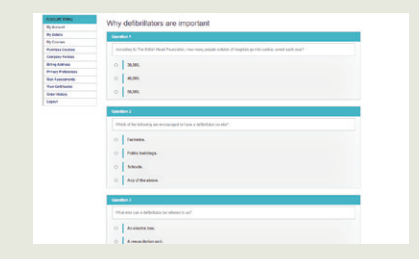
Final exam - certificates provided.

Automated External Defibrillators (AEDs) are used to deliver a shock to a casualty who is in cardiac arrest. You can use an AED on your own or with a helper.